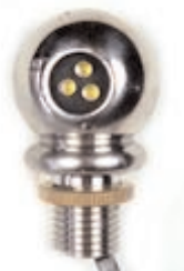
Tristar Ball Mount