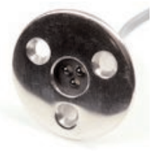
Tristar Face Mount