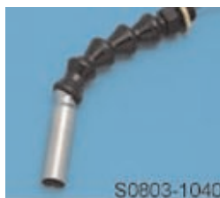
TRISTAR WITH STALK