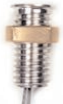
Tristar Back Mount