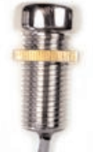
Tristar Bulkhead Mount